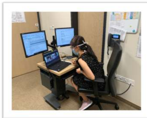
SingHealth Polyclinics Family Physician doing video consultation with the elderly patient in the polyclinic.